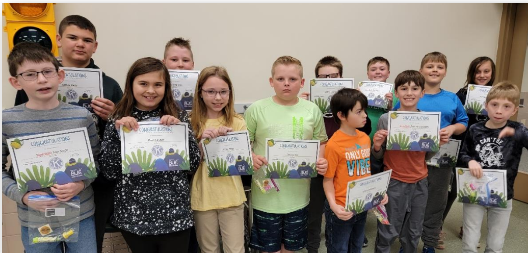
50 students who maintained or improved their grades received certificates and prizes, plus special prizes for the kindergarten students!