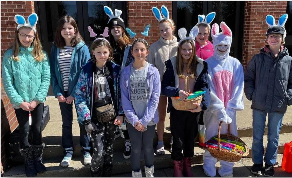
Members of the Parker Middle School Builders Club were a big help at the annual Shadbush Easter Egg Hunt!